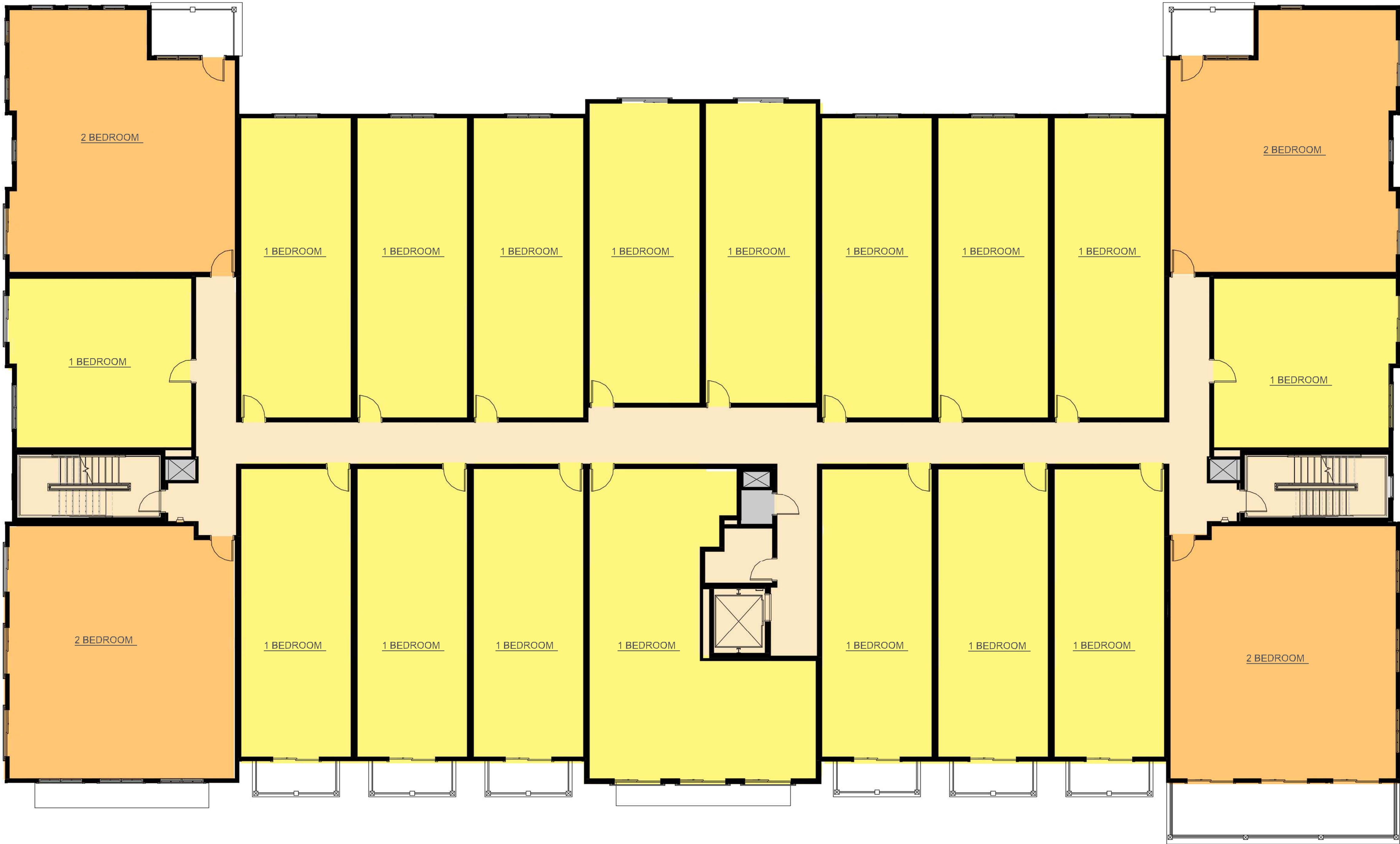
BUILDING PLAN: SECOND FLOOR - 55 UNITS Scale: 1/16" = 1'-0"

The above illustrations are representative of the architectural style. They are not meant to illustrate the final design or materials but are intended to depict the size, mass, and general materials of the proposed building. ©2022 BartonPartners Architects Planners, Inc. All rights reserved.