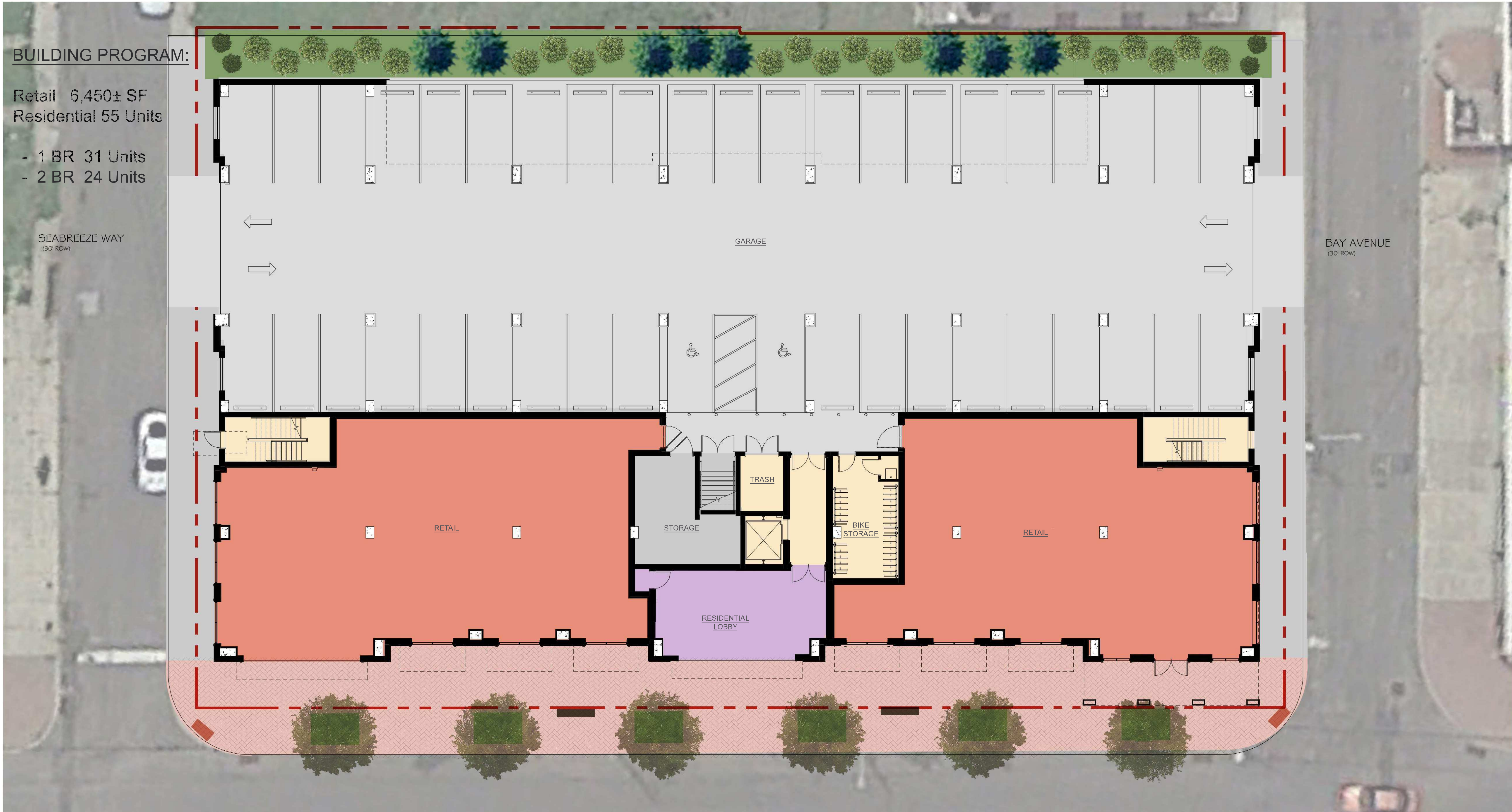
BUILDING PLAN: GROUND FLOOR - 55 UNITS Scale: 1/16" = 1'-0"

The above illustrations are representative of the architectural style. They are not meant to illustrate the final design or materials but are intended to depict the size, mass, and general materials of the proposed building.