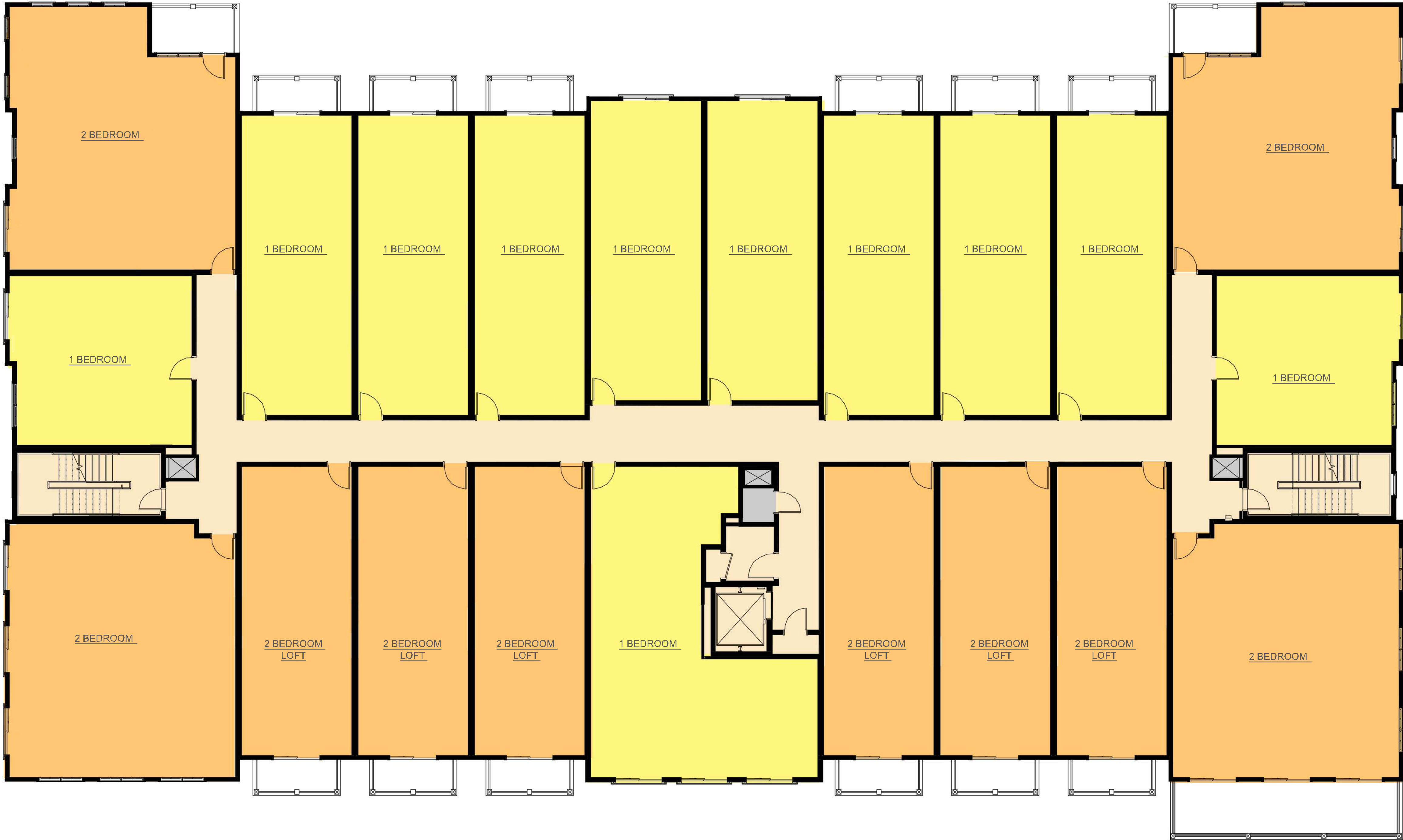
BUILDING PLAN: THIRD FLOOR - 55 UNITS Scale: 1/16" = 1'-0"

The above illustrations are representative of the architectural style. They are not meant to illustrate the final design or materials but are intended to depict the size, mass, and general materials of the proposed building. ©2022 BartonPartners Architects Planners, Inc. All rights reserved.