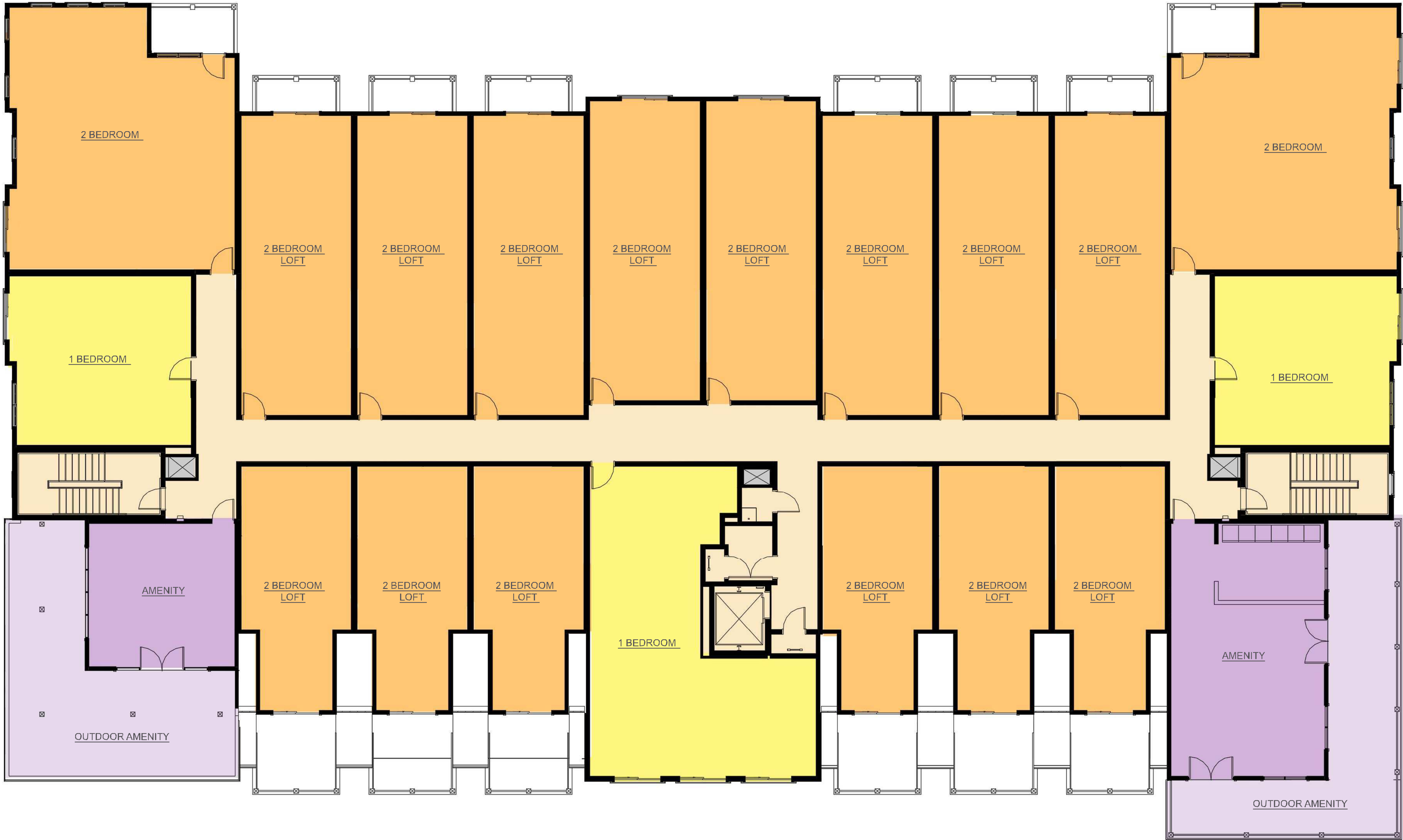
BUILDING PLAN: FOURTH FLOOR - 55 UNITS Scale: 1/16" = 1'-0"

The above illustrations are representative of the architectural style. They are not meant to illustrate the final design or materials but are intended to depict the size, mass, and general materials of the proposed building. ©2022 BartonPartners Architects Planners, Inc. All rights reserved.